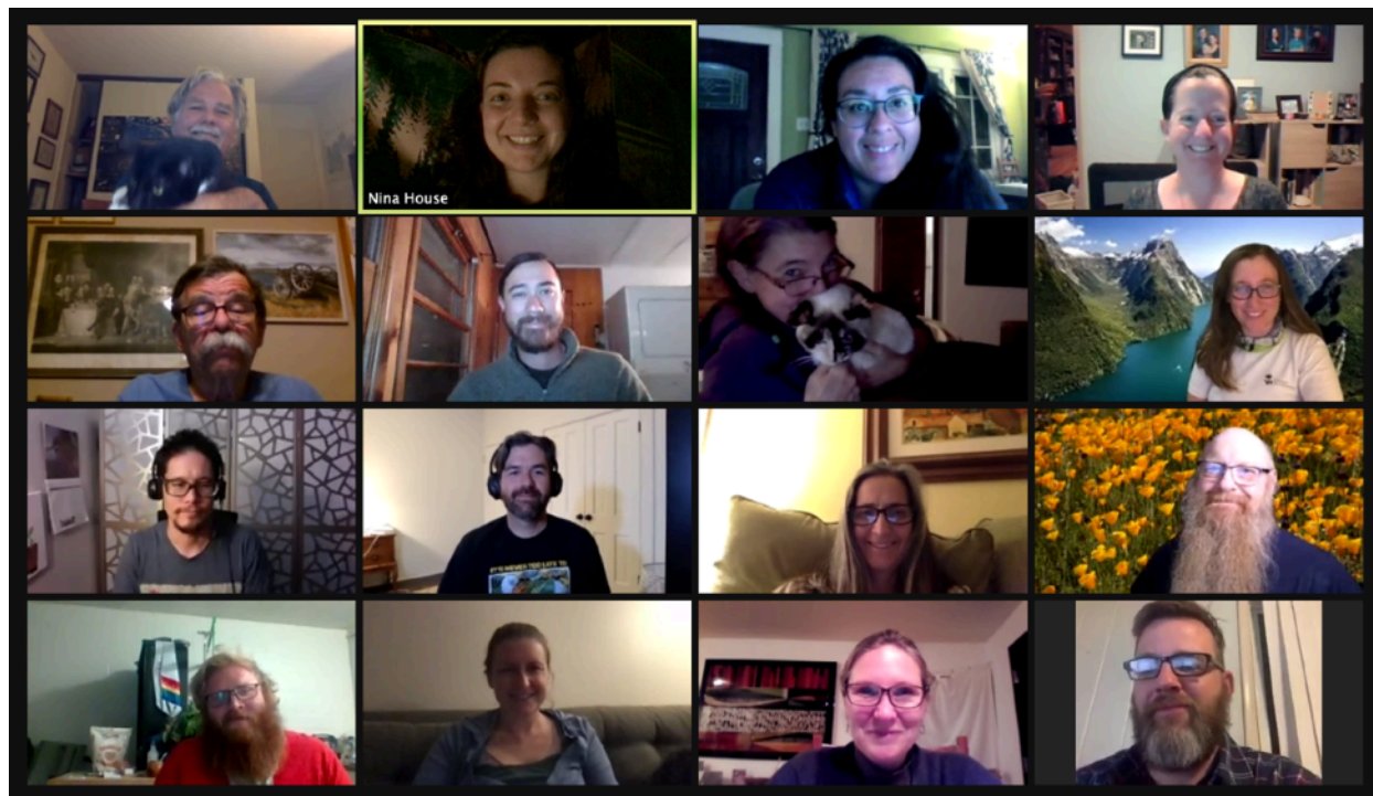
The 2021 SoCalBot board, meeting via zoom!

southern California and has also done field work throughout California and the southwestern U.S.